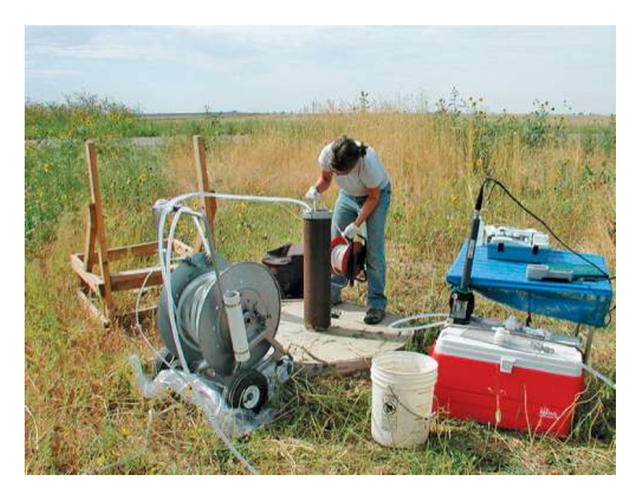
Figure 5 – Typical Groundwater Quality Sampling Event

In general, the use of existing water quality data within the basin should be done to the greatest extent possible if it achieves the DQOs for the GSP. In some cases it may be necessary to collect additional water quality data to support monitoring programs or evaluate specific projects. The USGS National Field Manual for the Collection of Water Quality Data (Wilde, 2005) should be used to guide the collection of reliable data. Figure 5 illustrates a typical groundwater quality sampling setup.