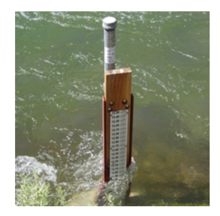
Figure 6 – Simple Stilling Well and Staff Gage Setup