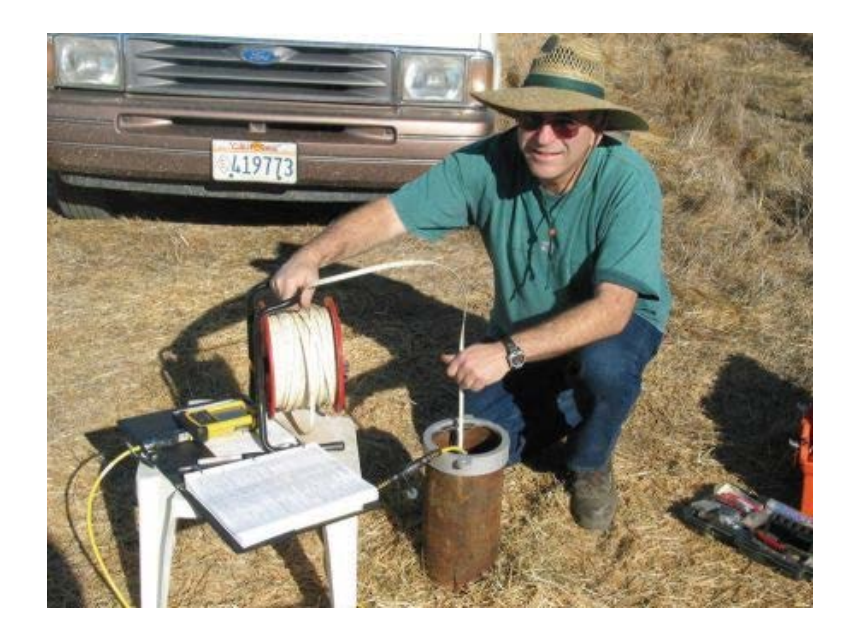
Figure 3 – Collection of Water Level Measurement and Pressure Transducer Download

Well construction, anticipated groundwater level, groundwater level measuring equipment, field conditions, and well operations should be considered prior collection of the groundwater level measurement. The USGS Groundwater Technical Procedures (Cunningham and Schalk, 2011) provide a thorough set of procedures which can be used to establish specific Standard Operating Procedures (SOPs) for a local agency. Figure 3 illustrates a typical groundwater level measuring event and simultaneous pressure transducer download.